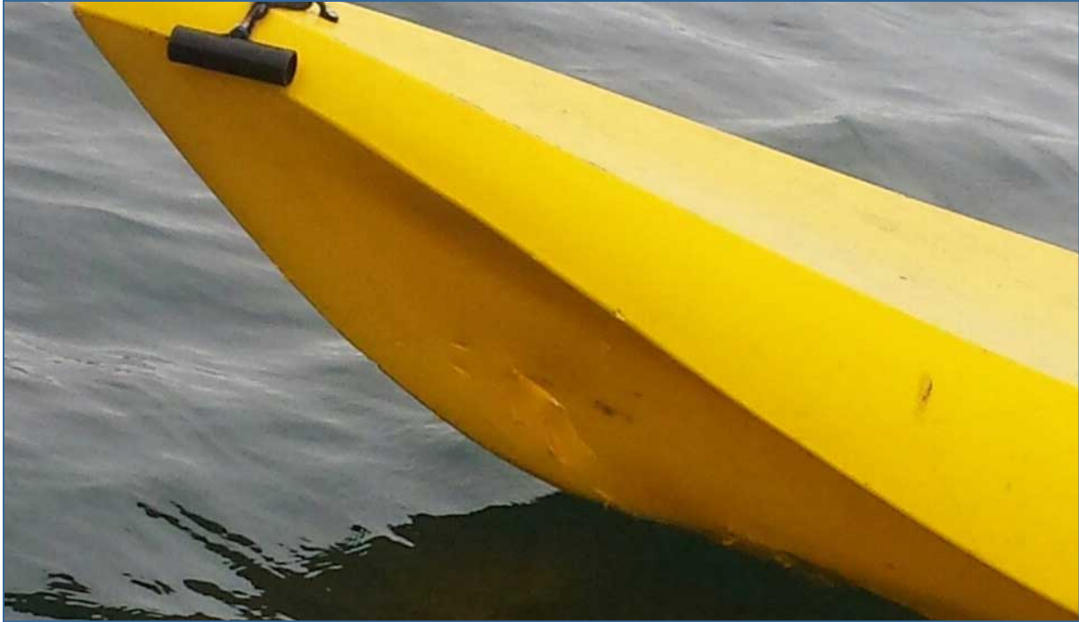
Tooth marks of the shark are visible on the hull of the kayak

COMMENT: The shark did not display any aggression toward the man in the water, but effectively communicated that it wanted the kayak to leave the area.