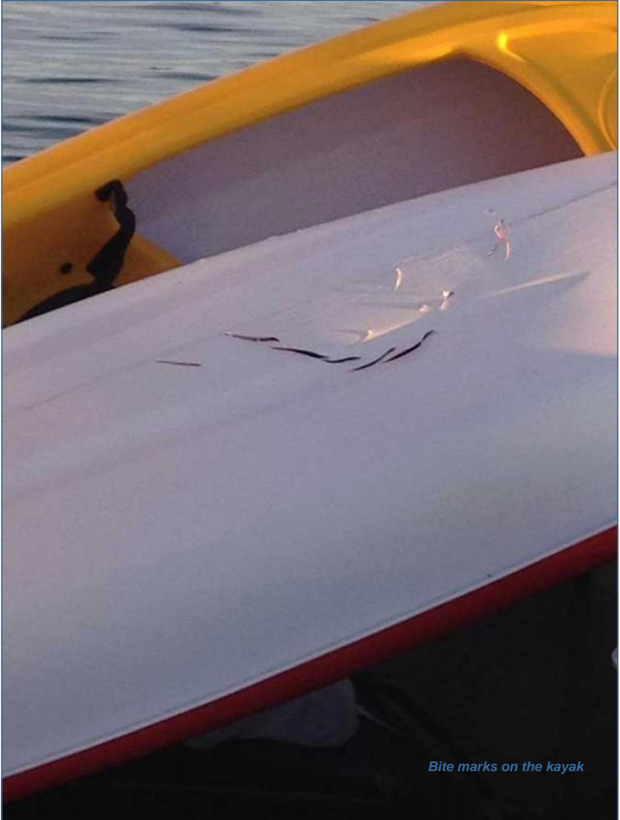
Bite marks on the kayak

Global Shark Accident File, 2014. All rights reserved. This report may not be abridged or reproduced in any form without written permission of the Global Shark Accident File.