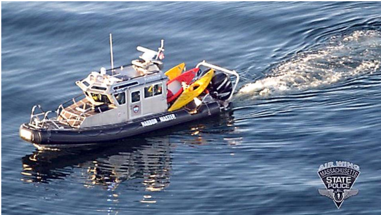
A helicopter from the Massachusetts State Police Air Wing responded over the Plymouth coastline after two kayakers were attacked by a shark off Manomet. The air crew observed the Harbor Master's rescue operations. Neither woman was injured. Photo shows the Harbor Master vessel carrying the kayakers back to shore.

SPECIES: According to officials from the Massachusetts Division of Marine Fisheries, the incident involved a white between 12- and 14-feet in length, based on tooth fragments and bite radius on the kayak.