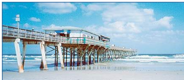
Sunglow Pier, Daytona Beach Shores

LOCATION: The incident took place in the Atlantic Ocean off the 3600 block South Ocean Beach, Daytona Beach Shores, Volusia County, Florida, USA. 29.2°N, 81.0°W