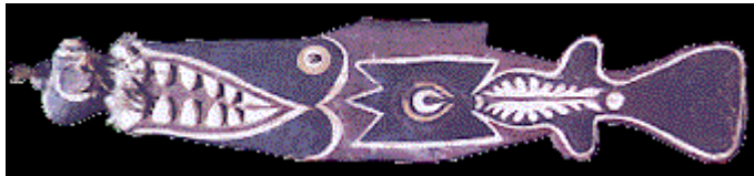
Animal effigy clan totem (gi lopala) representing a fish devouring a clan father. These were used during initiation ceremonies at Gogodala, Aramia River, Western Province, PNG