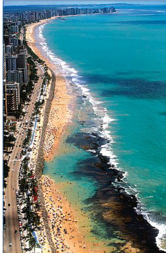
Boa Viagem beach. The dark area is a line of reefs (in Portuguese, 'recifes') which rim the shore. As the tide goes out, natural swimming pools are formed.

CASE INVESTIGATORS: Alfred Xuereb; Paulo Mariano Lopes, Global Shark Accident File