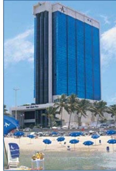
Hotel Atlante Plaza