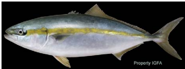
Yellowtail, also known as Japanese amberjack Seriola quinqueradiata