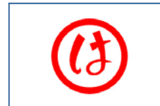
House Flag of Taiyo Gyogyo

1 Taiyo Gyogyo was established in the 1880s as a family firm and has evolved into the world's biggest fishing multinational with many subsidiaries including tuna and whaling fleets.