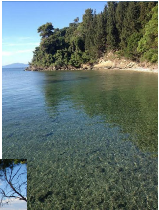
Mon Repos, Corfu