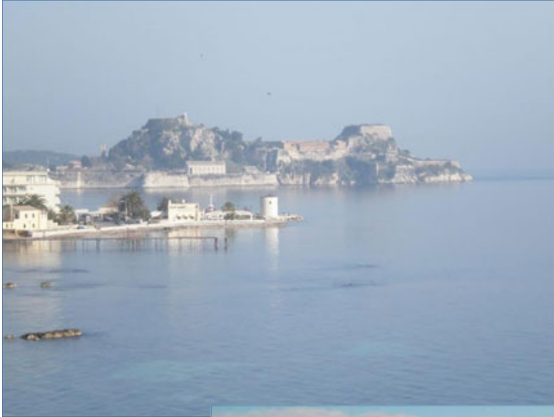
Mon Repos, Corfu