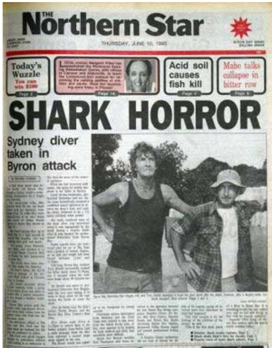
The front page of The Northern Star after the 1993 shark attack at Byron Bay.