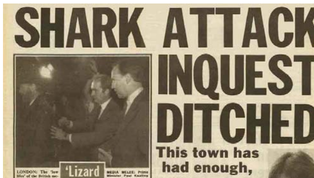
Gold Coast Bulletin, September 18, 1993