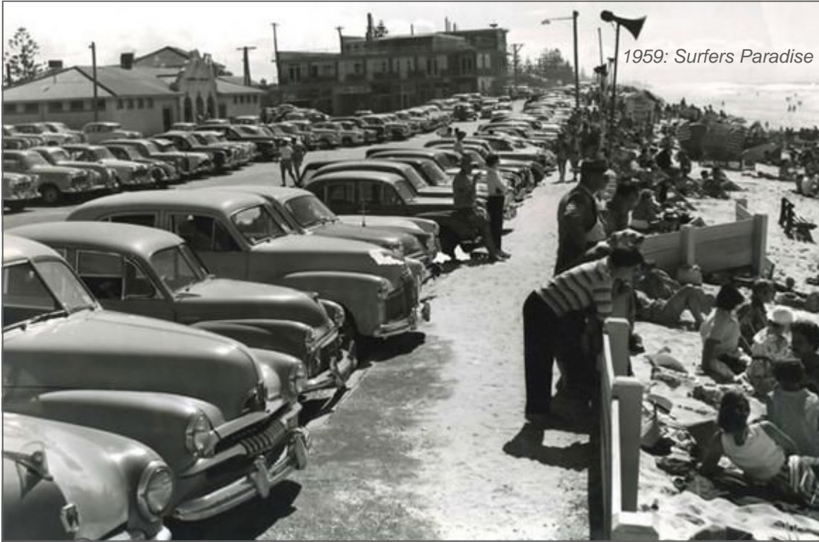
1959: Surfers Paradise