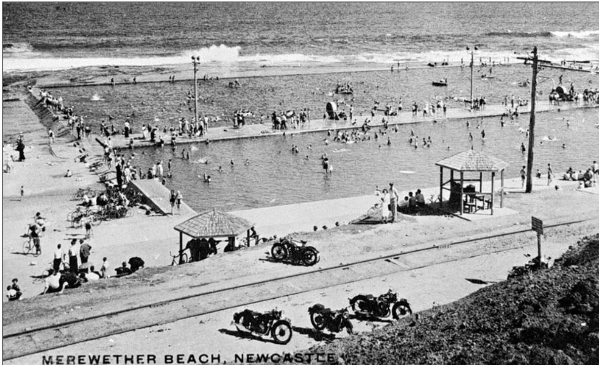
MEREWETHER BEACH, NEWCASTLE