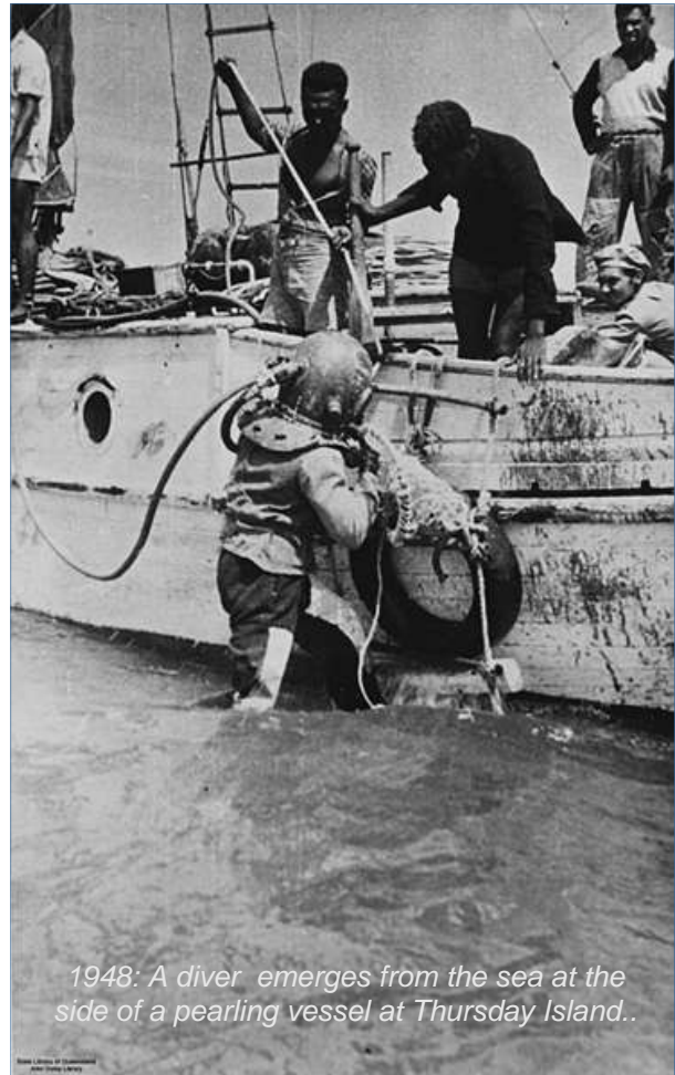
1948: A diver emerges from the sea at the side of a pearling vessel at Thursday Island..