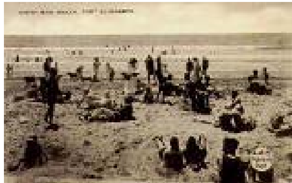
North End Beach, Port Elizabeth