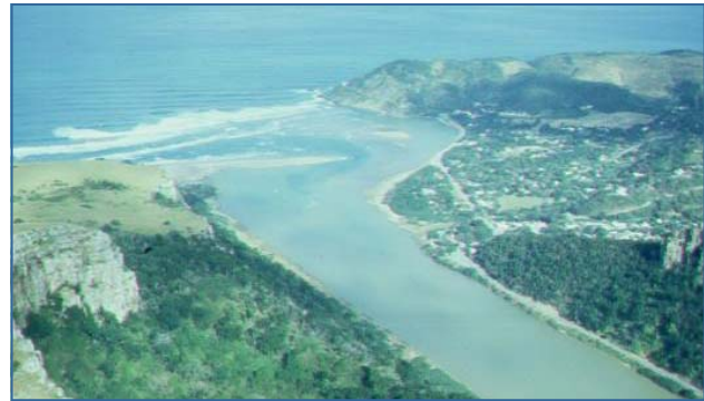
Mzimvubu River Mouth